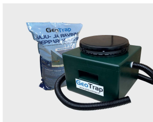
GeoTrap dry toilet filter

For effective ventilation especially indoors and in public toilets.