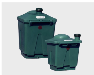
Green Toilet spare container

Volume 120 or 330 liters. Scales up the system endlessly. No need to handle raw toilet waste.