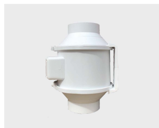
Electrical duct fan

Boosts the ventilation and dehydration. Less excess liquid to handle.